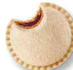
2.6 oz. Smucker's® Uncrustables® Sandwich (Grape or Strawberry)