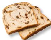
Whole Grain Cinnamon Raisin Bread