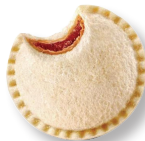
2.6 oz. Smucker's® Uncrustables® Sandwich (Grape or Strawberry)