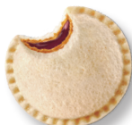
2.6 oz. Smucker's® Uncrustables® Sandwich (Grape or Strawberry)