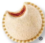
2.6 oz. Smucker's® Uncrustables® Sandwich (Grape or Strawberry)