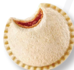
2.6 oz. Smucker's® Uncrustables® Sandwich (Grape or Strawberry)